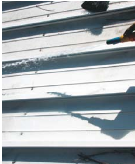
2) Use a hose to blow away twigs and soften hardened dirt.