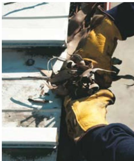
2) Wear correct protection when clearing leaves and twigs.