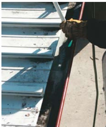
5) Use a soft bristle brush and sweep the dirt out. Rinse again.