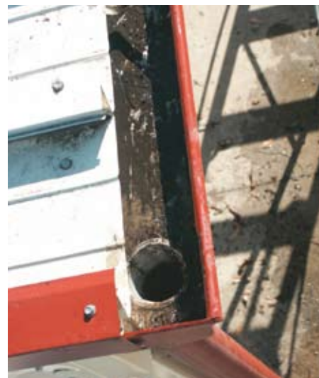
3) When litter is removed, the layer of hardened dirt is revealed below.