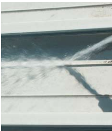
4) The roof cladding should be clean after you rinse.