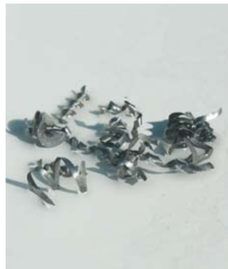
6) Ensure all swarf (drill waste) is removed from the work area.