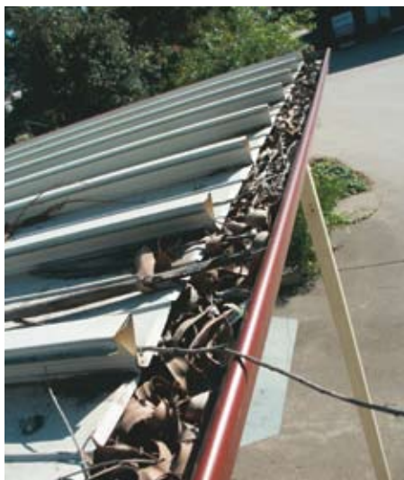
1) A typical suburban gutter clogged with leaf litter prior to cleaning.