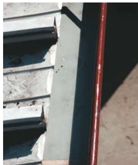
6) When the gutter has been cleaned, it should look like this.