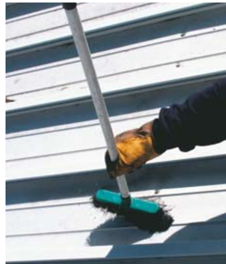
3) Use a soft bristle brush to sweep out the pans. Rinse with water.