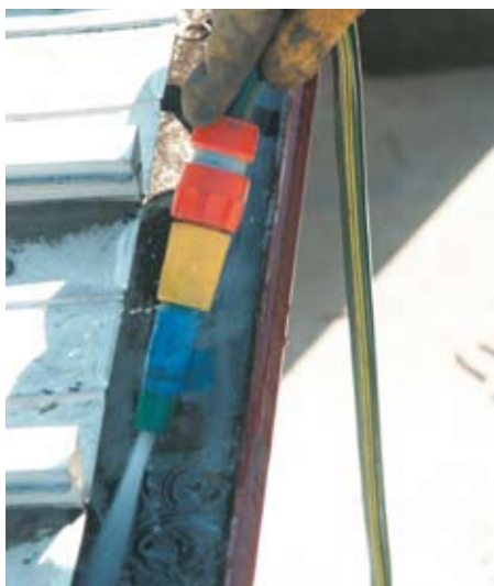
4) Rinse the gutter with water to soften and break up the dirt.