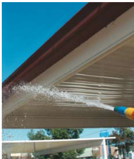
5) Use a hose to rinse the underside of gutters and roofs.