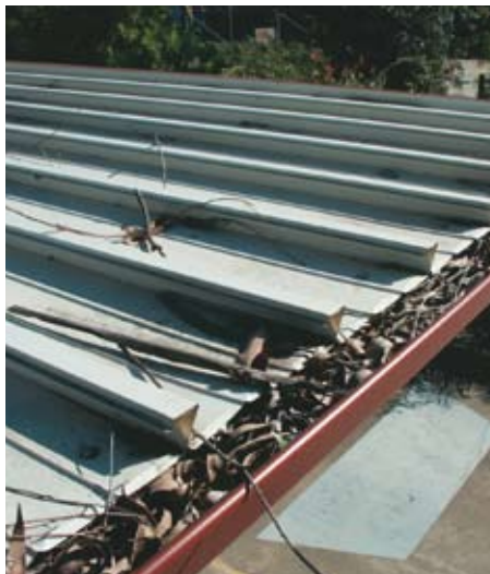
1) A typical suburban roof with leaf litter and dirt prior to cleaning.